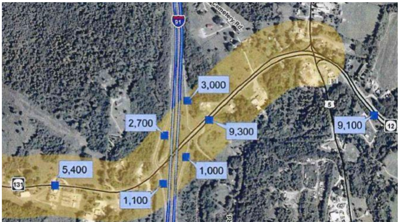
Figure A: 2007 Average Annual Daily Traffic Volume